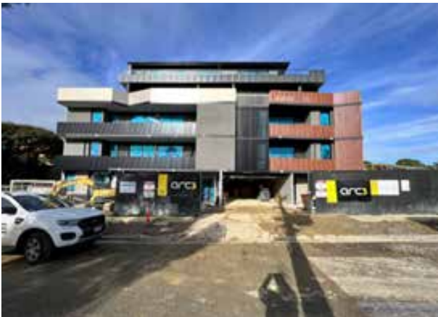
Vermont getting closer to completion in June 2023