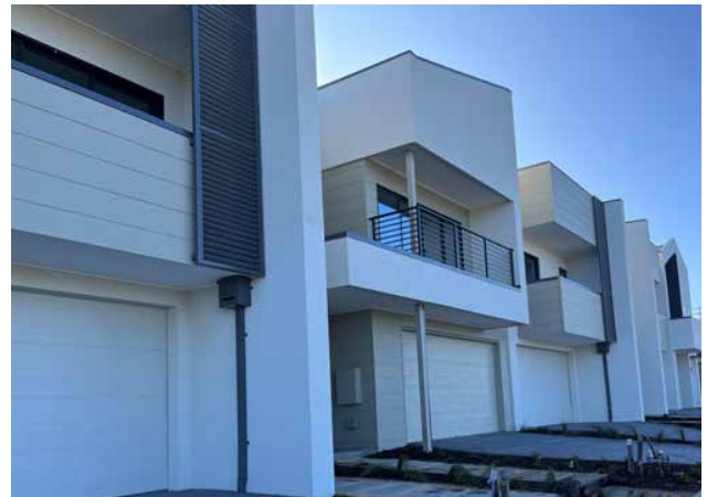
Big Housing Build Properties completed at Wollert