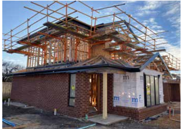
Warrnambool advancing second storey, May 2023